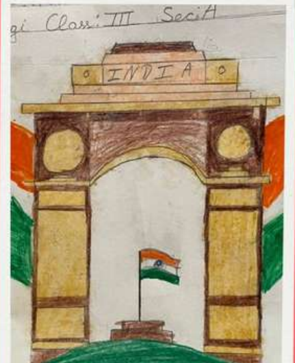
AISHANI TYAGI III-A