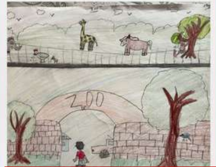
MEGHA SHARMA III - E