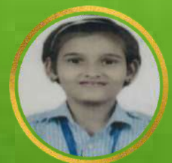
BY SARAH FATIMAH V-D

The tourist place I like the most is Kerala. Kerala is also known as "God's own country". Kerala has a pleasant climate and lush green vegetation which soothers one's mind. Kerala is famous for its beautiful beaches, museums, temples and most importantly, its backwaters. The backwaters of Kerala steal everyone's heart. We can also stay in house boats which create an unforgettable experience. Munnar is a very beautiful hill station and one of the best places to visit in Kerala. It has a very pleasant weather, one can experience adventure activities also. Lush sprawling tea and aromatic spice plantations, lovely lakes and mountain streams make it a wonderful destination. The Kumarakom bird sanctuary in Kumarakom is one of the best bird watching spots in India. Fort Kochi is one of the oldest forts of Kerala.