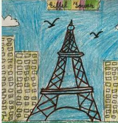
SRISHTI SUMAN III-D