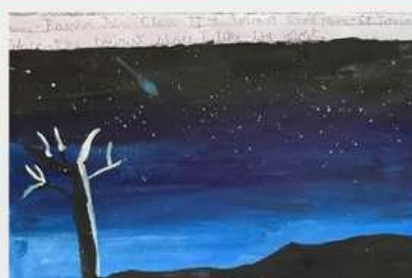
KAASHVI JAIN IV-E